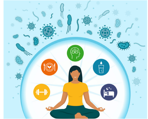
BOOST YOUR IMMUNE SYSTEM NATURALLY

The Immune Booster is a simple, daily wellness ritual that nourishes your immune system from the inside out using time-honored herbs and botanicals. With soothing teas and a potent oil, it helps your body adapt to stress, fight off oxidative damage, and restore balance for better energy, clarity, and protection - naturally.*